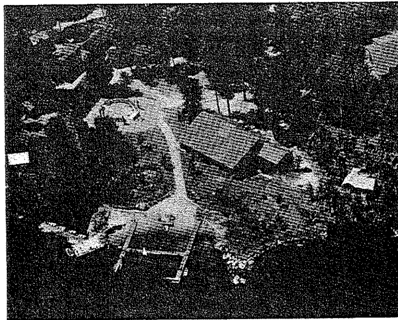
Aerial view of West End House Camp